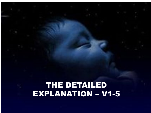
THE DETAILED EXPLANATION - V1-5