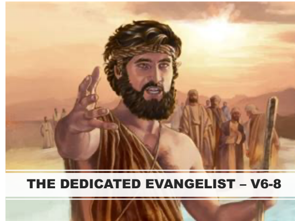
THE DEDICATED EVANGELIST - V6-8