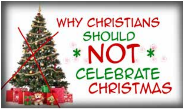
THE DISAPPOINTMENTS EXPERIENCED