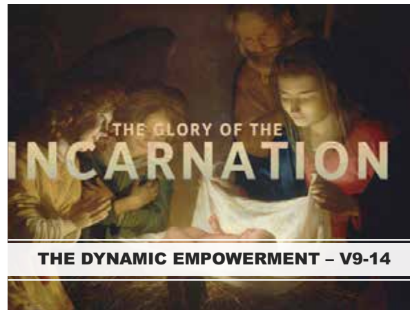
THE DYNAMIC EMPOWERMENT - V9-14