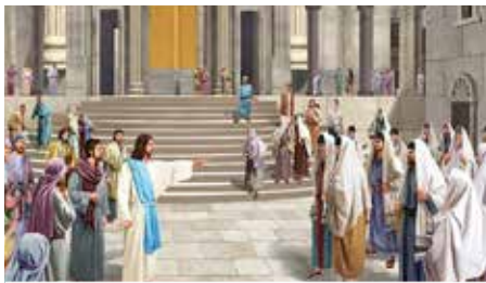
THE PROVOCATION - V33