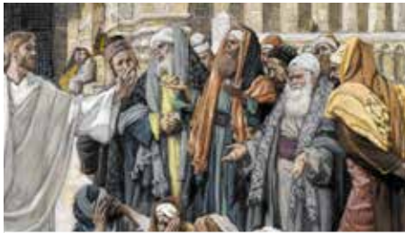
THE PROPOSITION - V28