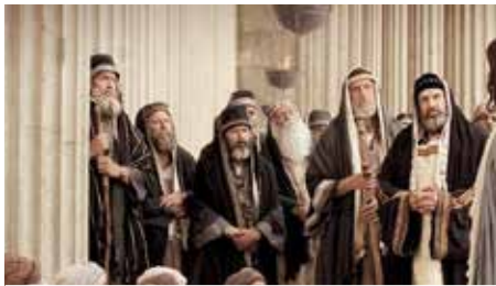
THE PEOPLE - V27B