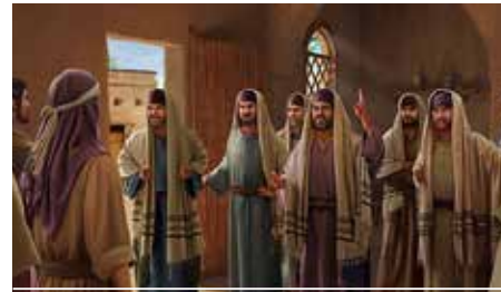
A CONFRONTATION TO AUTHORITY - V29-30