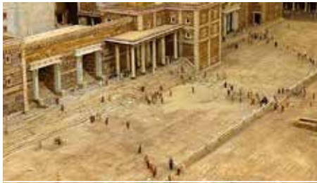
THE PLACE - V27A