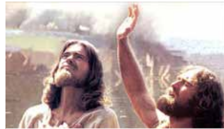
THE PROOF - V30