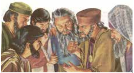
THE PROBLEM - V31B-32