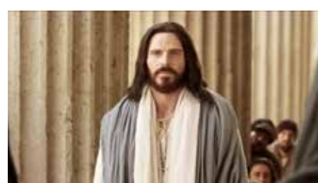
THE POSITION - V29B