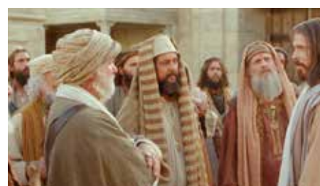
THE PROPOSAL - V29A