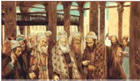
A CHALLENGE FOR AUTHORITY - V31-33