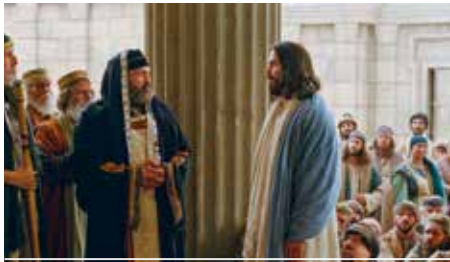
A CONTEST FOR AUTHORITY - V27-28