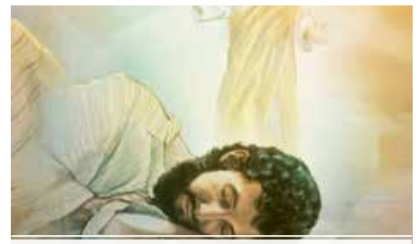
THE DECISION EXPRESSED - V24-25