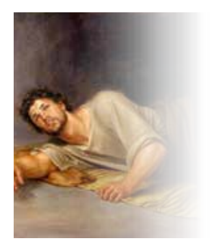
THE APPROVAL -V24A

When Joseph woke up, he did what the Lord's angel had told him to do.