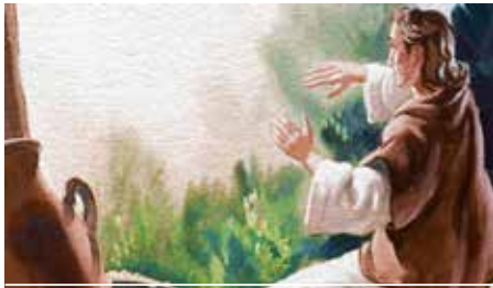
THE CONFIRMATION ENDORSED – V16-24