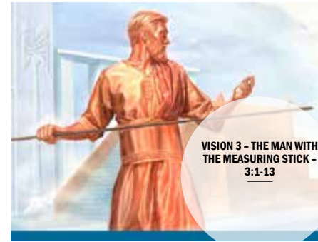
VISION 3 - THE MAN WITH THE MEASURING STICK - 3:1-13