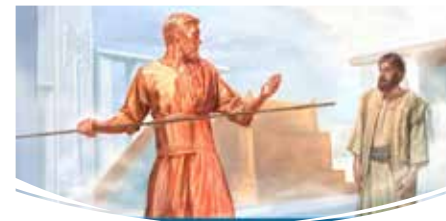
THE SURVEYOR PRESENTED - V1 Then I looked up and saw a man holding a line for measuring things.