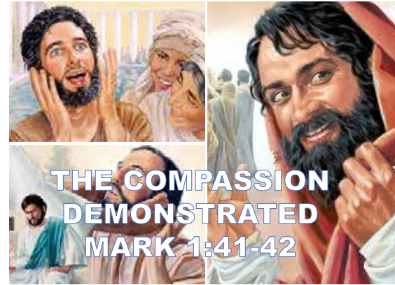
THE COMPASSION DEMONSTRATED MARK 1:41-42