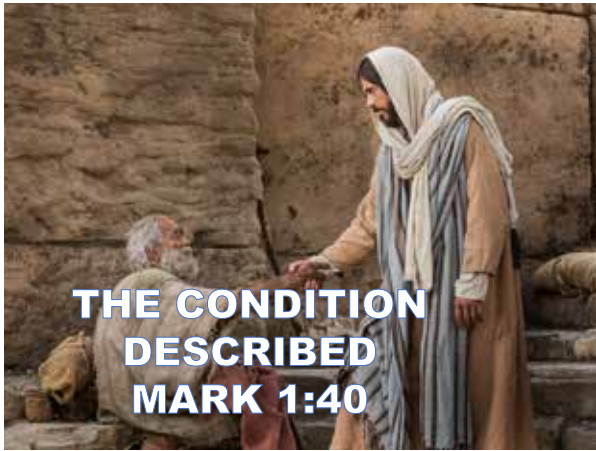
THE CONDITION DESCRIBED MARK 1:40