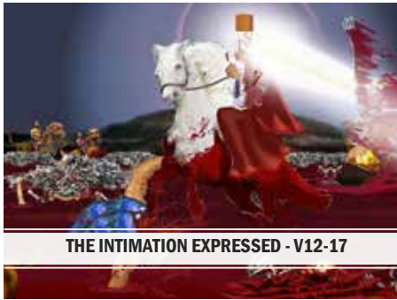
THE INTIMATION EXPRESSED - V12-17