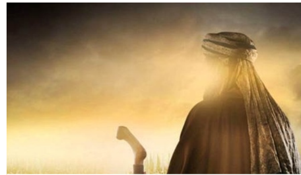
THE CONFIRMING EVIDENCE – V18-26