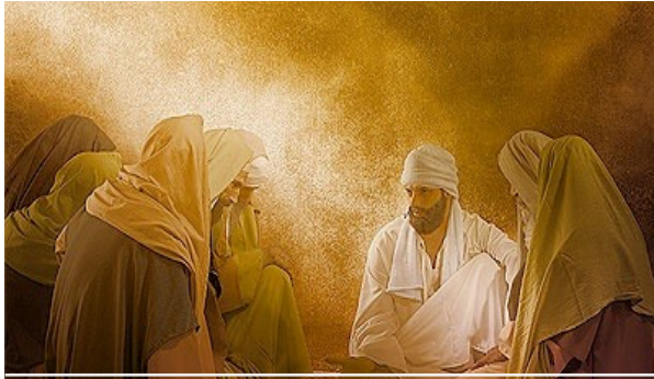
THE CONFRONTATION EXPRESSED – V1-4