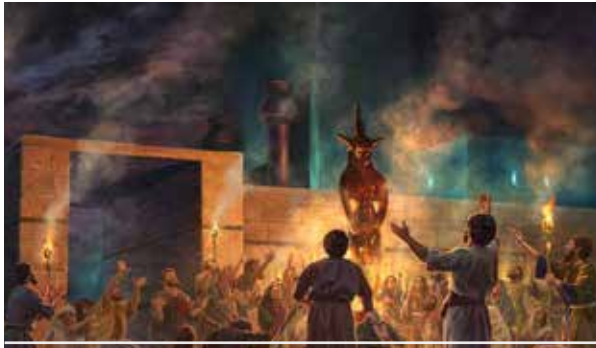
THE CAUSE EXPLAINED – V27-32