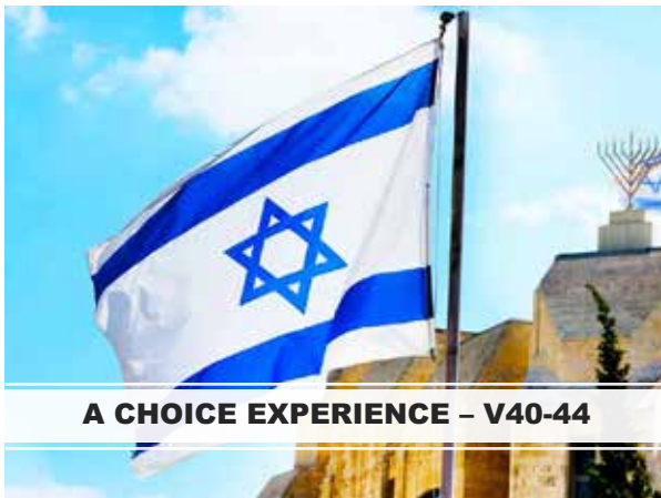
A CHOICE EXPERIENCE – V40-44