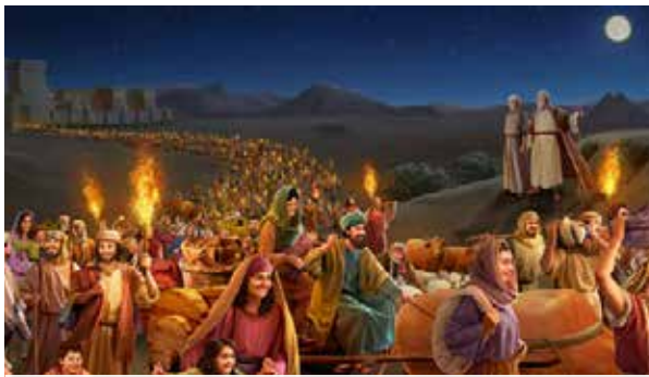
THE COMMITMENT EXHIBITED – V5-9