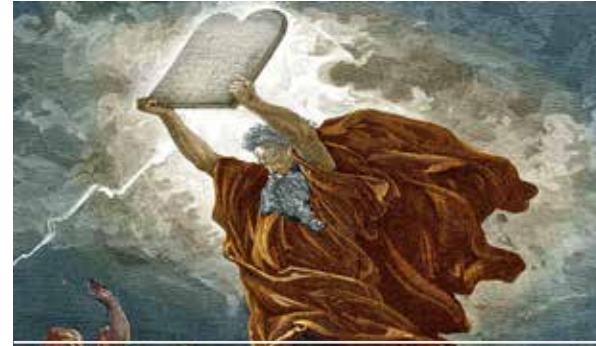
THE CRITICAL EXAMINATION – V10-17