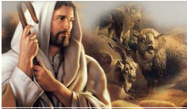
THE CONTRASTING EXAMPLE – V33-39