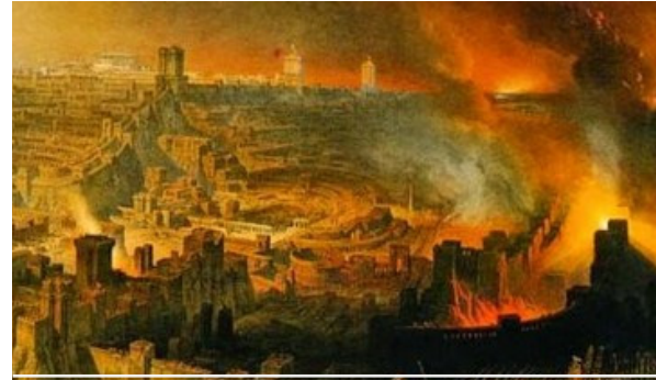
THE ANIMOSITY – V8-9