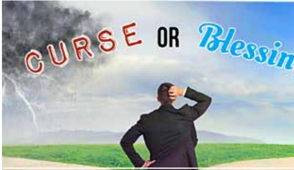
THE MASSIVE CONSEQUENCES – V5-17