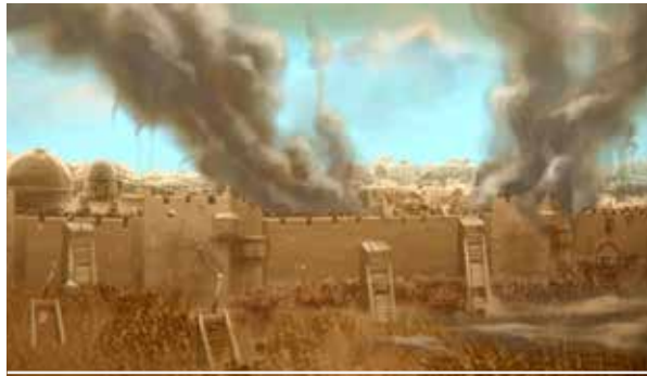
THE ALLOWANCE - V16-17