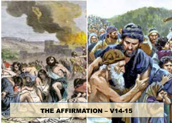
THE AFFIRMATION - V14-15