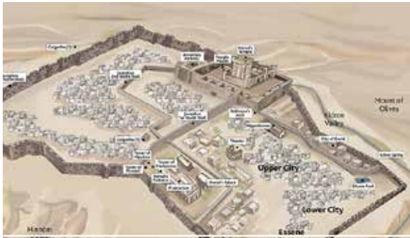
THE ASSESSMENT – V5-6