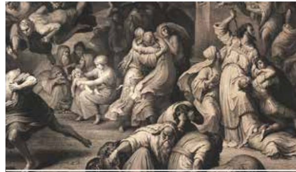
THE ASSERTION – V10-12