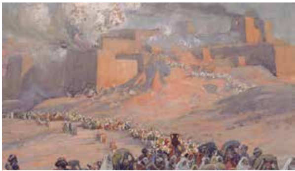
THE ARROGANCE – V7