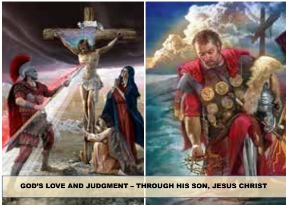
GOD'S LOVE AND JUDGMENT - THROUGH HIS SON, JESUS CHRIST