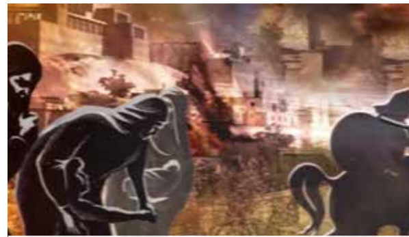
THE ANGER – V13