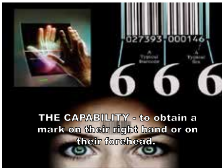
THE CAPABILITY - to obtain a mark on their right hand or on their forehead.