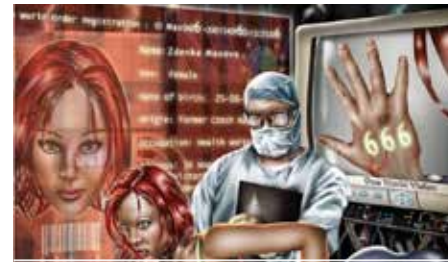
THE COMMAND - Thus no one was allowed