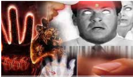
A MARK OF IDENTIFICATION - V16