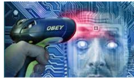
THE CONTROL - to buy or sell things unless