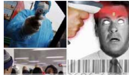
A MARK OF ISOLATION - V17