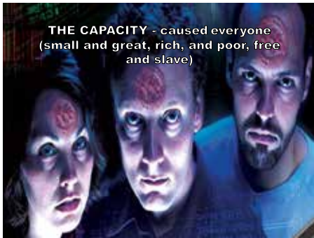
THE CAPACITY - caused everyone (small and great, rich, and poor, free and slave)