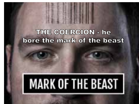
THE COERCION - he bore the mark of the beast