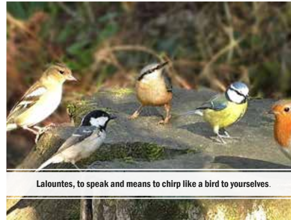
Lalountes, to speak and means to chirp like a bird to yourselves.