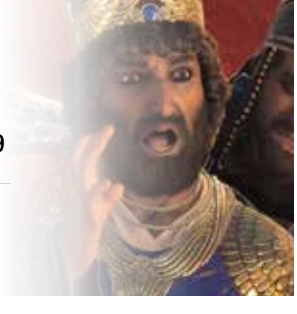
THE ANSWER - V7 So he answered the king, "This is what you could do for the man you want very much to honour.