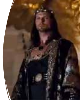
THE APPROPRIATION -V10B Take the robe and the horse just as you have said, and do all this for Mordecai the Jew who sits at the king's gate.

THE ATTENDANT -V10A The king commanded Haman, "Go quickly