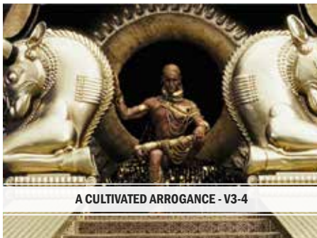
A CULTIVATED ARROGANCE - V3-4