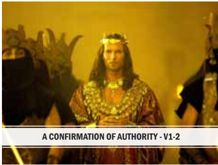
A CONFIRMATION OF AUTHORITY - V1-2