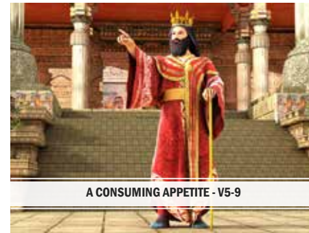
A CONSUMING APPETITE - V5-9

The banquet lasted one hundred eighty days. All during that time King Xerxes was showing off the great wealth of his kingdom and his own great riches and glory.