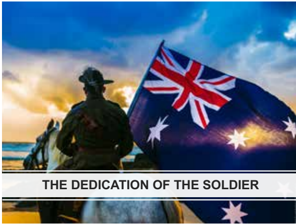
THE DEDICATION OF THE SOLDIER