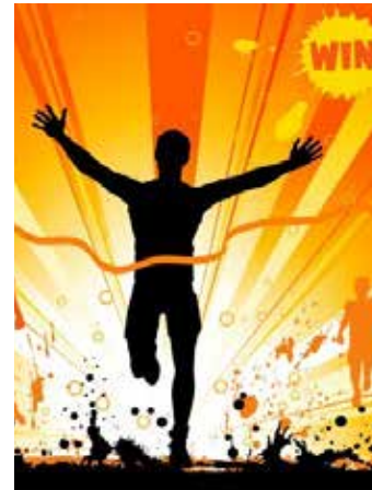
THE DISCIPLINE OF AN ATHLETE

Also an athlete who takes part in a contest must obey all the rules in order to win.