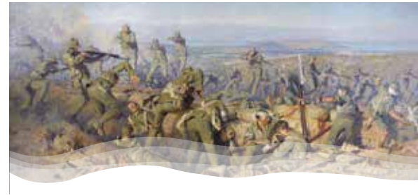
THE SPIRITUAL WARFARE - V4B so no one serving in the army wastes time with everyday matters.