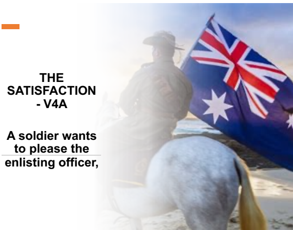
THE SATISFACTION - V4A

Also an athlete who takes part in a contest must obey all the rules in order to win.