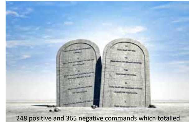
48 positive and 365 negative commands which totalle 613 commands overall