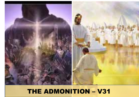
THE ADMONITION – V31