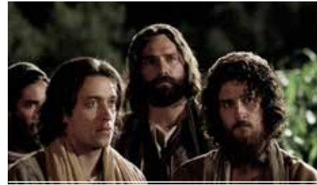
THE ANXIETY – V26