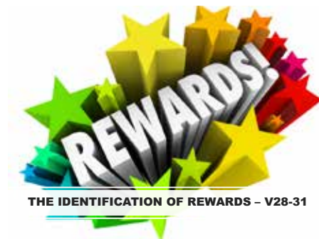
THE IDENTIFICATION OF REWARDS – V28-31