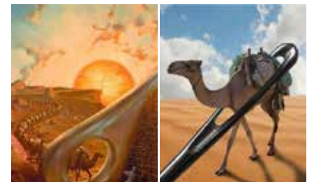
THE ANALOGY – V25