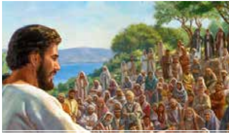
THE ANNOUNCEMENT – V23