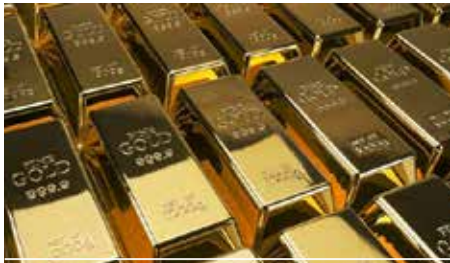
THE ISSUES OF RICHES – MARK 10:23-25