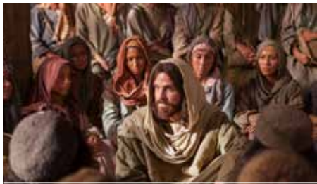
THE ASTONISHMENT – V24