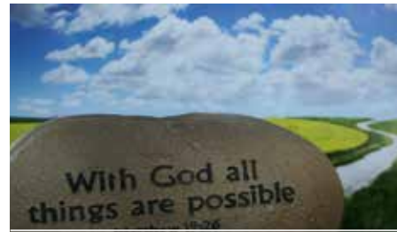
THE ANSWER – V27