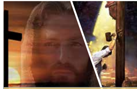
THE IMPOSSIBILITY OF REDEMPTION – V26-27