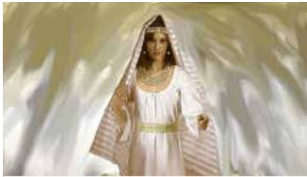
REMARRIAGE - RESTORED AND BLESSED