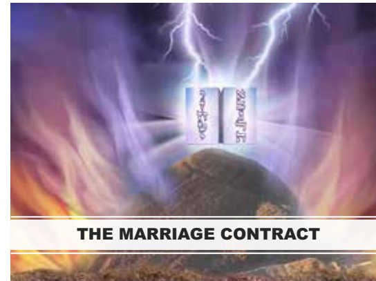
THE MARRIAGE CONTRACT