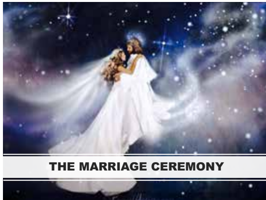
THE MARRIAGE CEREMONY