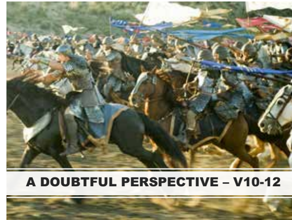
A DOUBTFUL PERSPECTIVE - V10-12