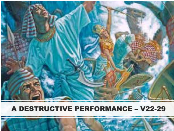
A DESTRUCTIVE PERFORMANCE - V22-29