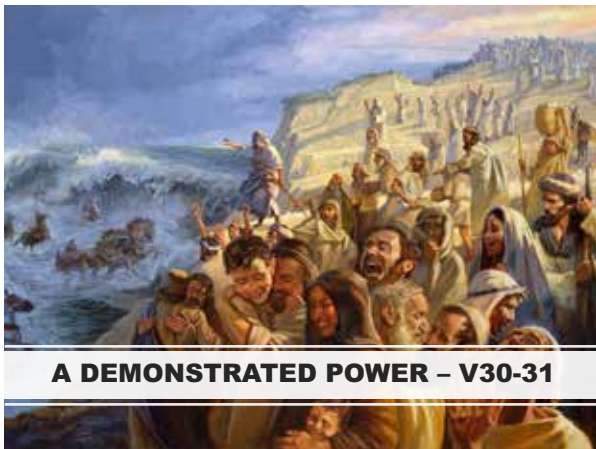
A DEMONSTRATED POWER - V30-31