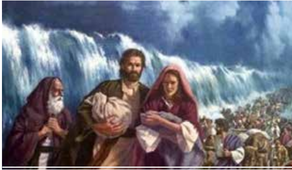
A DESIGNATED PURPOSE - V15-21