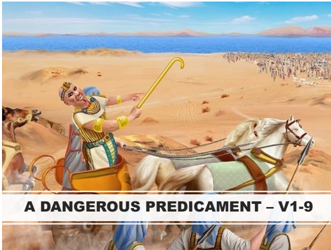
A DANGEROUS PREDICAMENT - V1-9