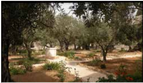
A FALLING – V27A