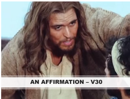
AN AFFIRMATION - V30