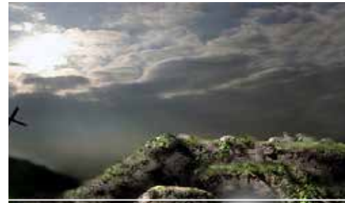
A FANTASTIC PROMISE – V28