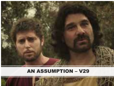
AN ASSUMPTION - V29