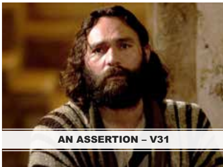
AN ASSERTION - V31