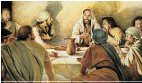
A FRIGHTENING PREDICTION – V27