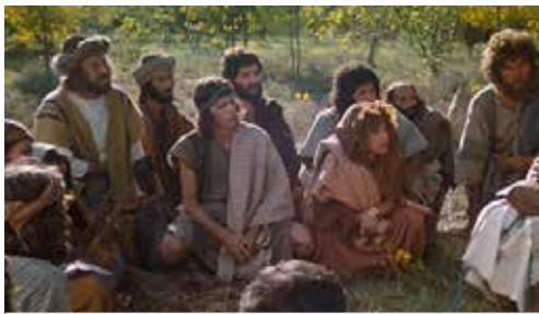
A FULFILLMENT – V27B