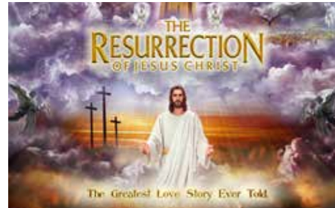
A RESURRECTION – V28A