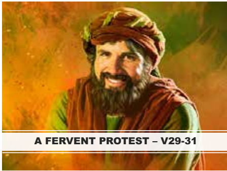
A FERVENT PROTEST - V29-31