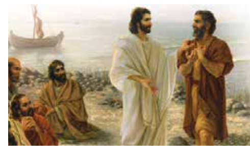
A RESTORATION – V28B