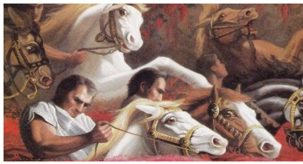
Psalm 45:5-6, Your arrows are sharp and penetrate the hearts of the king's enemies. Nations fall at your feet. <sup>6</sup> Your throne, O God, is permanent. The sceptre of your kingdom is a sceptre of justice.