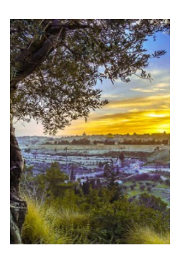
A DELUGE OF RESOURCES - V1

Ask the Lord for rain during the springtime rains. The Lord is the one who makes the clouds. He sends the showers and gives everyone green fields.