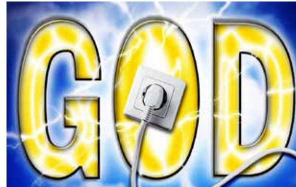
THE SUPERNATURAL DYNAMIC – V6-10