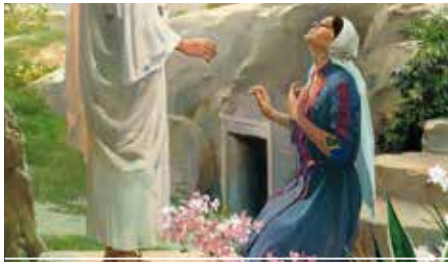
THE CONFIRMATION – V9-10, 12-13A