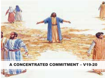
A CONCENTRATED COMMITMENT - V19-20