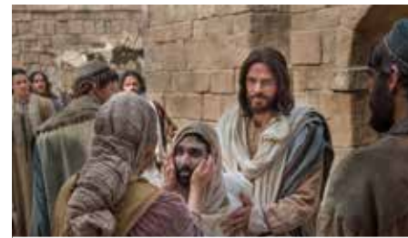
THE CONFIRMATION – V17-28