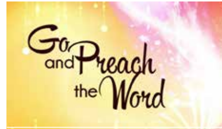
THE COMMAND – V15