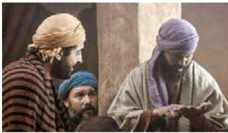
THE CONTROVERSY – V11, 13B