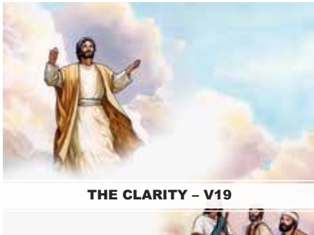
THE CLARITY - V19