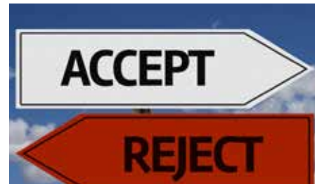
THE CHALLENGE – V16