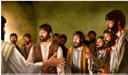
A CONFRONTING CRISIS – V9-14