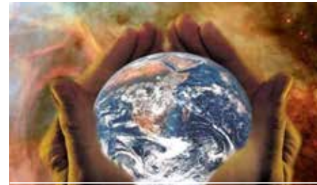
A CHALLENGING COMMISSION – V15-18