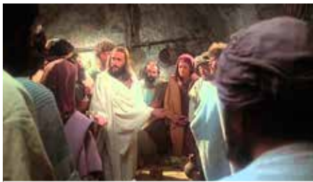
THE CONFRONTATION – V14