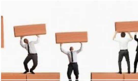
THE IMPORTANT FOUNDATION