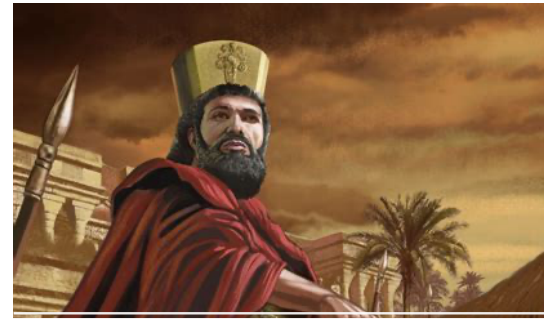
THE INFLUENCE OF A FATHER