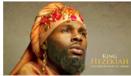
THE IMPRESSIVE FOCUS