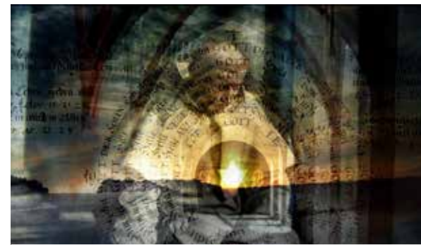
RISE OF GNOSTICISM – MYSTICAL RELIGION

Οἴδατε ὅτι ὅτε ἔθνη ἦτε πρὸς τὰ εἰδωλα τὰ ἀφωνα ὡς ἂν ἤγεσθε ἀπαγόμενοι.