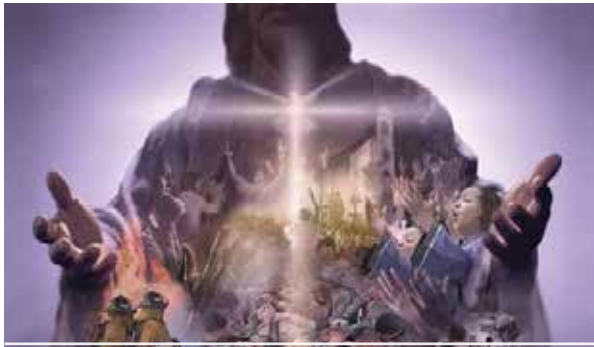
THE BODY OF CHRIST, ONE BODY, MANY MEMBERS