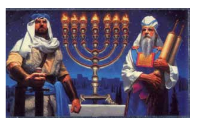
THE POWERFUL RESPONSE - V13-15