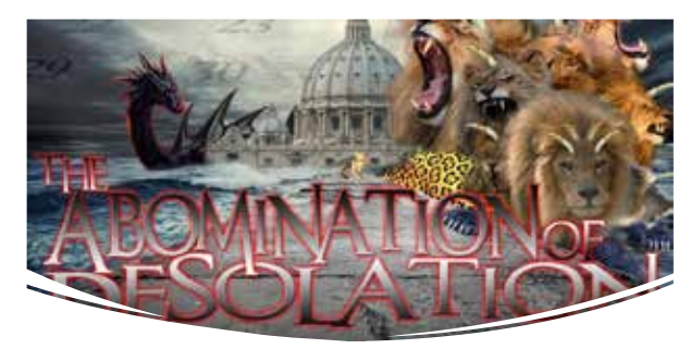
THE ASSERTION - V13

I will use Judah like a bow and Ephraim like the arrows. Jerusalem, I will use your men to fight the men of Greece. I will use you like a warrior's sword.