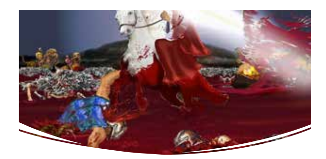
THE ADVOCATE - V15

Then the Lord will appear above them, and his arrows will shoot like lightning. The Lord God will blow the trumpet, and he will march in the storms of the south.