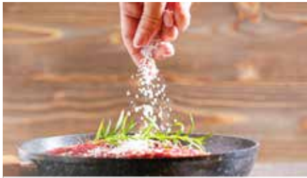
SALT PROVIDES FLAVOUR