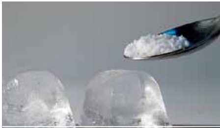
SALT PRODUCES CHANGES