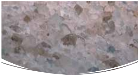
THE PROFIT OF SALT - V13C - It is good for nothing, except to be thrown out and walked on.