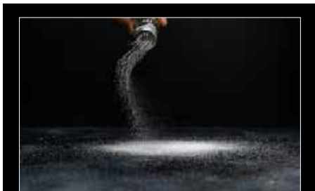
SALT NEEDS TO POURED OUT TO BE EFFECTIVE