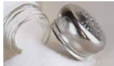
SALT PROMOTES THIRST