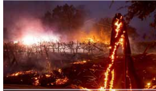
A PERSUASIVE ADDRESS - V4-5