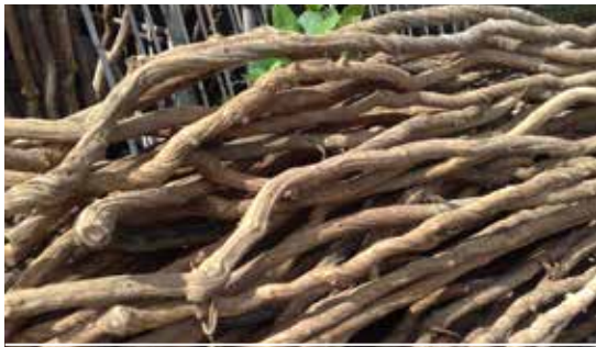
A PERTINENT ACTION - V3