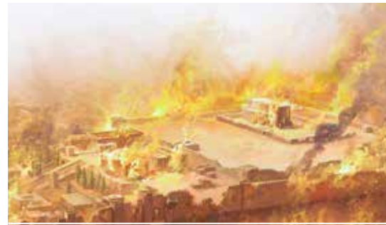
A PRACTICAL APPLICATION - V6