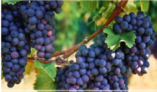
A PRODUCTIVE ACTIVITY - V1-2