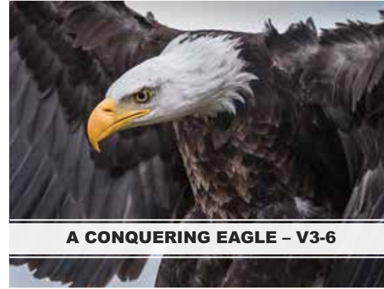
A CONQUERING EAGLE – V3-6