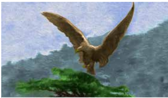
A COVER-UP EXPOSED - V9-10