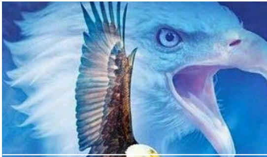
A CONTENDING EAGLE - V7-8